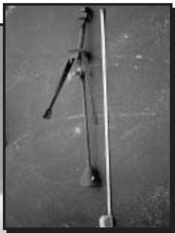
Greg and Chad are putting the final touches on the steeple (above) and the bell's clapper (right) needed some repairs before it would ever ring again. The tape measure shows that this clapper is over four-feet long.